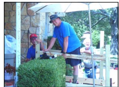
Greg's idea to bring the big umbrella was truly brilliant!