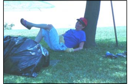
Roma seeks refuge from the HOT sun!