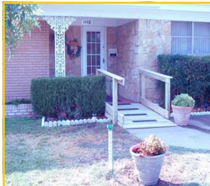
New ramp makes a homecoming possible. Tidied-up yard and fresh flowers make it extra special.