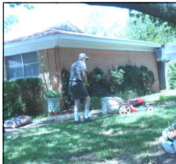
Ralph wouldn't call it quits until ever blade of grass was cut.