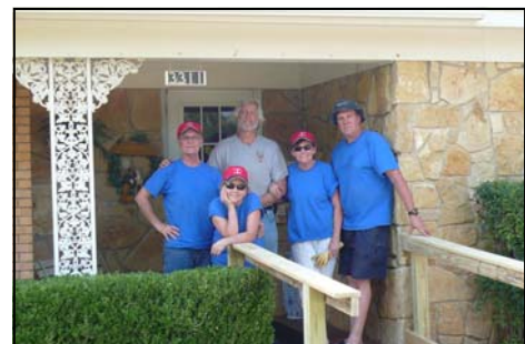
Yea, it's a wrap!